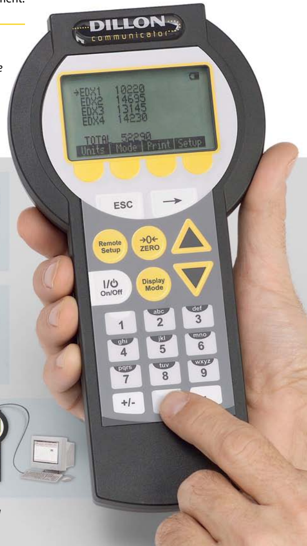
Optional Remote Communicator

A basic stand-alone model can be easily upgraded "in-the-field" to accommodate changing needs. Remote configuration, data acquisition and single point monitoring of multiple links are all possible with the hardwired or radio communication options available with the EDxtreme.