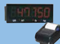
Displays & Printers