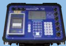
PT20™ Weighing CPU