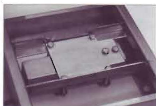
Optional stainless steel clamshell

The BenchMark™ SL performs exceptionally in a variety of industrial weighing environments, including food and chemical processing and commercial applications. 304 stainless steel construction is easily maintained and meets USDA requirements. The optional stainless steel clamshell load cell shield delivers added protection in wash-down environments.