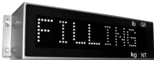
SURVIVOR LaserLight M-Series 8-character display 12-character display also available