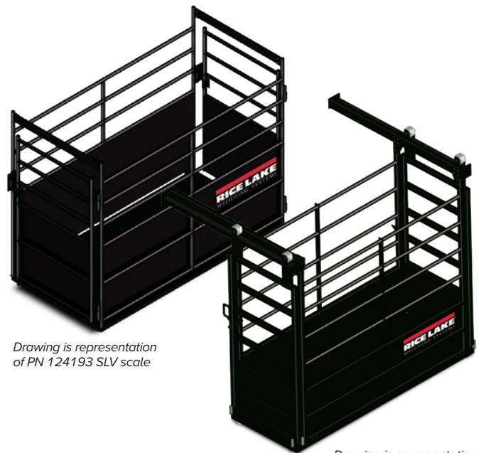
Drawing is representation of PN 124193 SLV scale