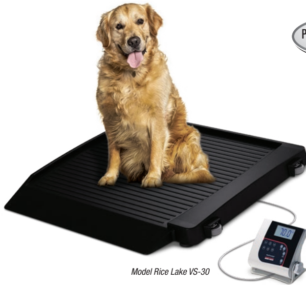
Model Rice Lake VS-30