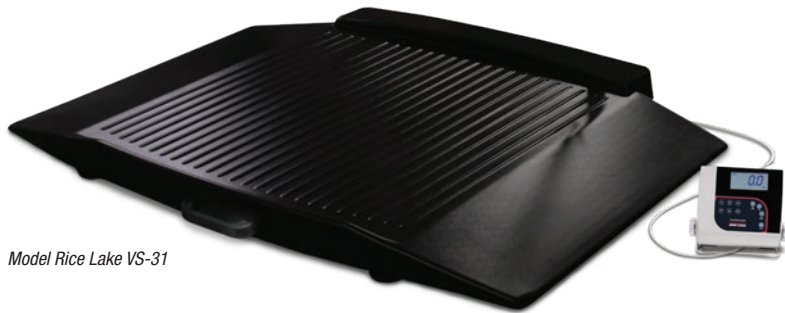
Model Rice Lake VS-31