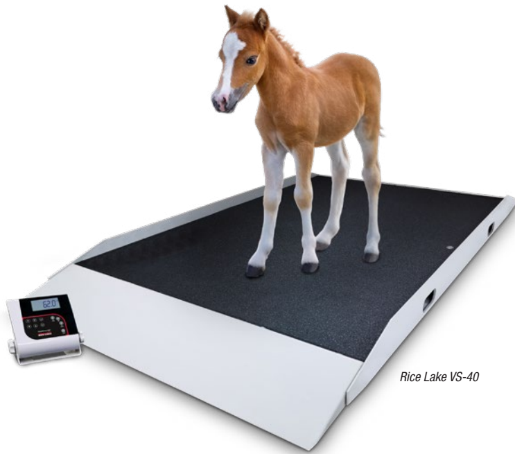
Rice Lake VS-40